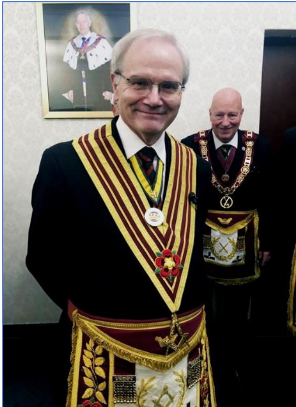
The previous day several Sussex brethren received promotion or appointment at the Alfred the Great Meeting.