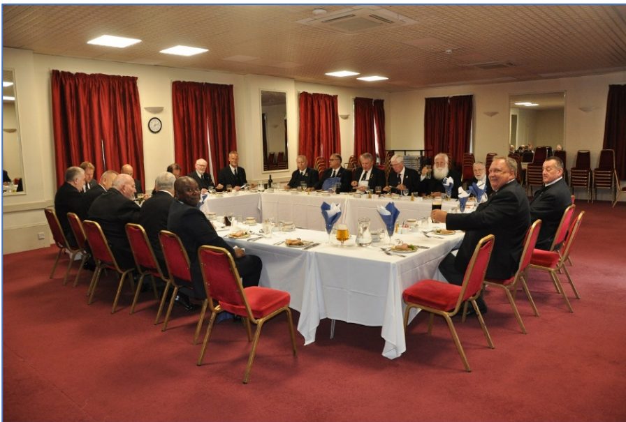
The meeting was closed and after photographs we retired to the bar for refreshments before sitting down to a most convivial meal at the Nutfield Masonic Centre.