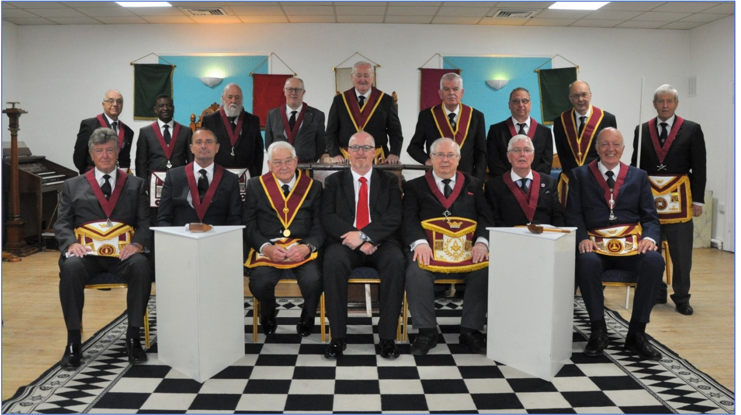
Afterwards the Brethren of the Sword of Constantine Court sat down to a curry meal with our two guests who said they had a most enjoyable time at our Athelstan meeting.